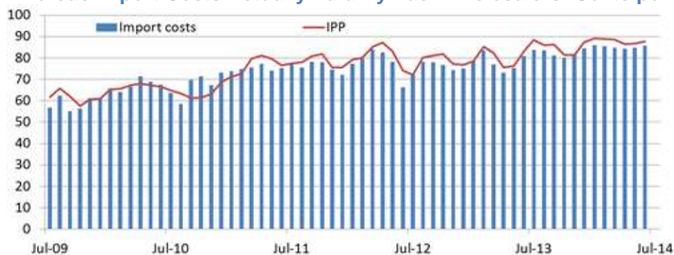
IPP Versus Import Costs Actually Paid By Fuel Wholesalers: Cents per litre

ACCC analysis clearly shows that the actual import costs paid by major fuel suppliers have closely followed the IPP over the past 3 years, with the difference averaging 2.6 cents per litre.