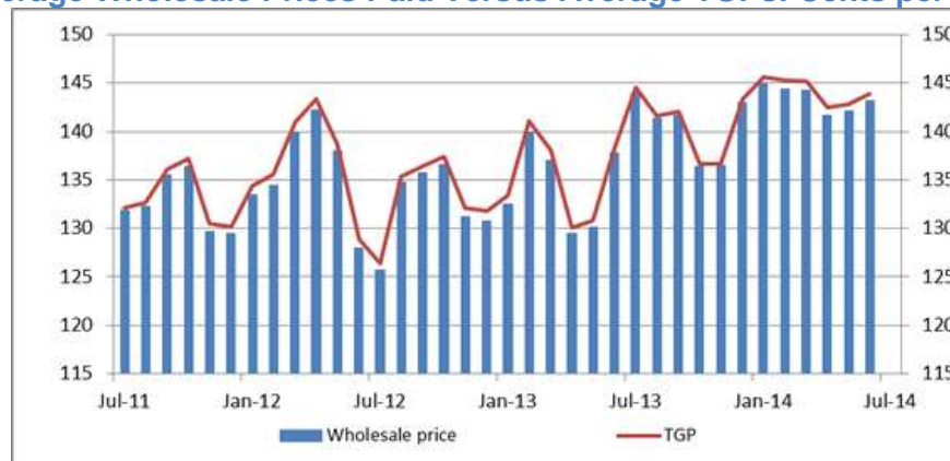
Average Wholesale Prices Paid Versus Average TGPs: Cents per litre